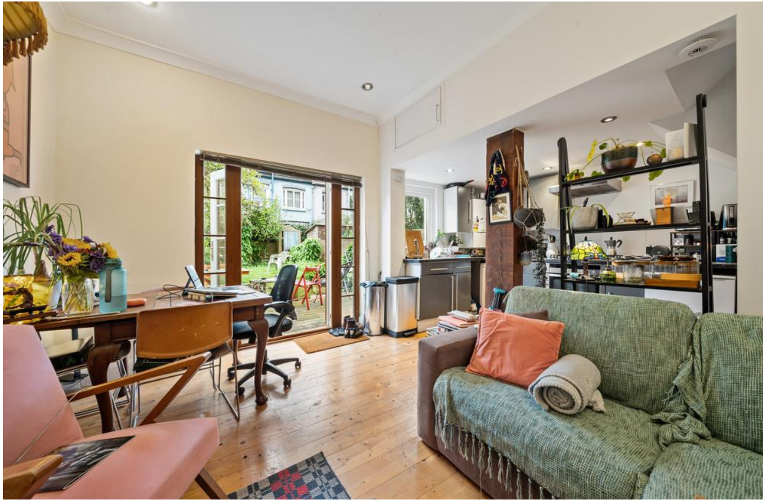
Marlborough Road, London