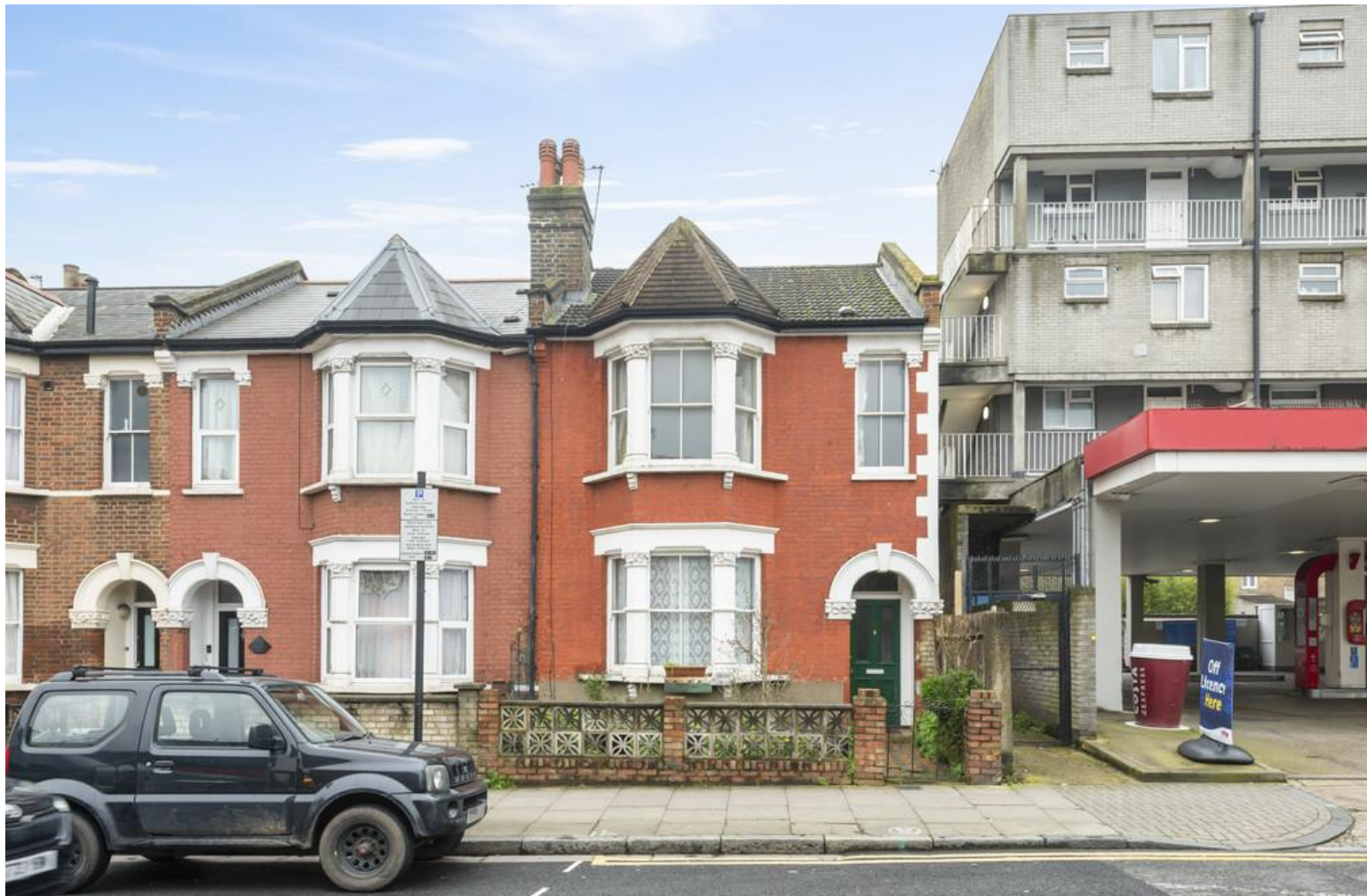
Hornsey Road, N7 6RA