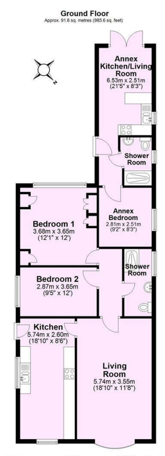
Total area: approx. 91.6 sq. metres (985.6 sq. feet)