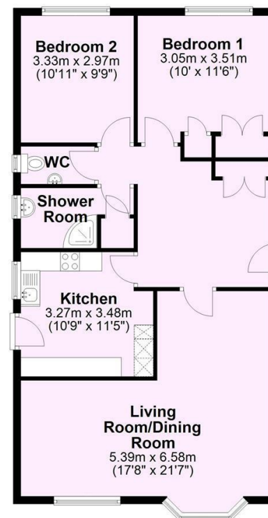
Total area: approx. 83.3 sq. metres (896.8 sq. feet)