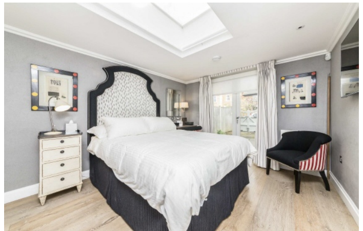
Arterberry Road, SW20