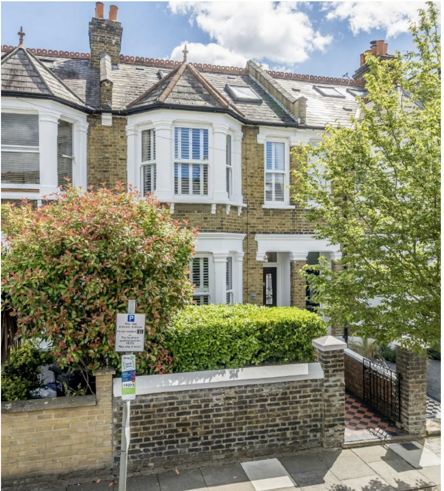
Hamilton Road, SW19 £1,395,000