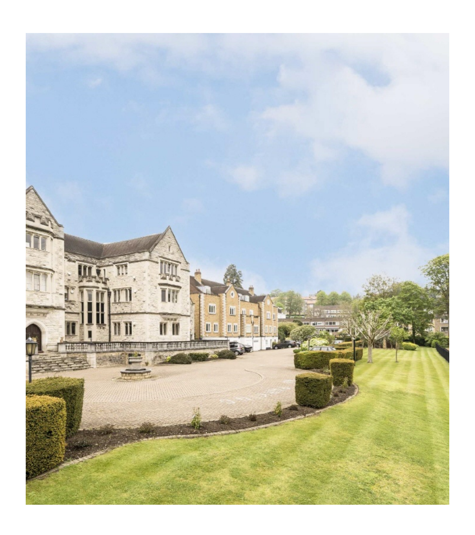
Royal Close, SW19 £1,695,000