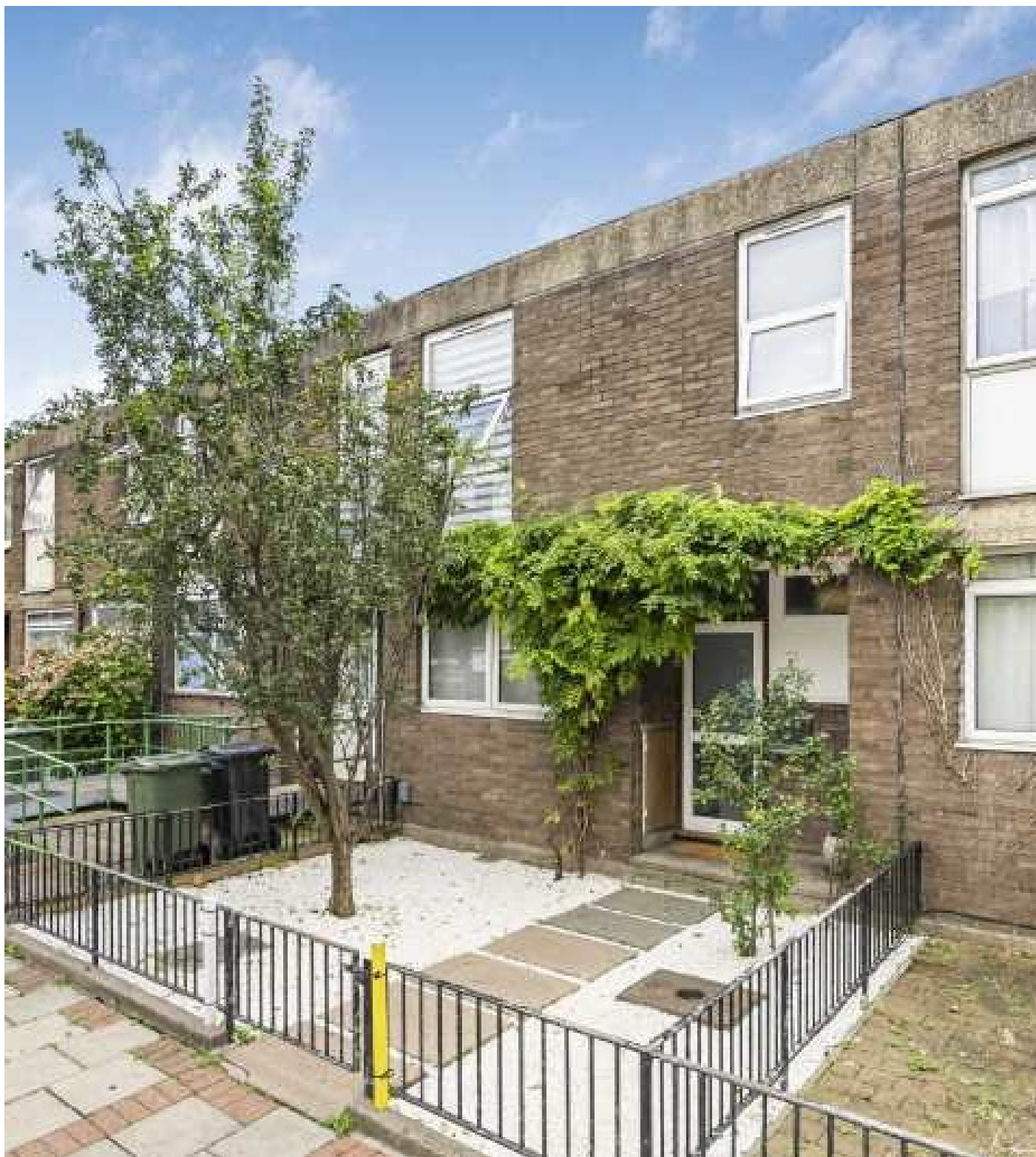
Cottage Grove, SW9 £675,000