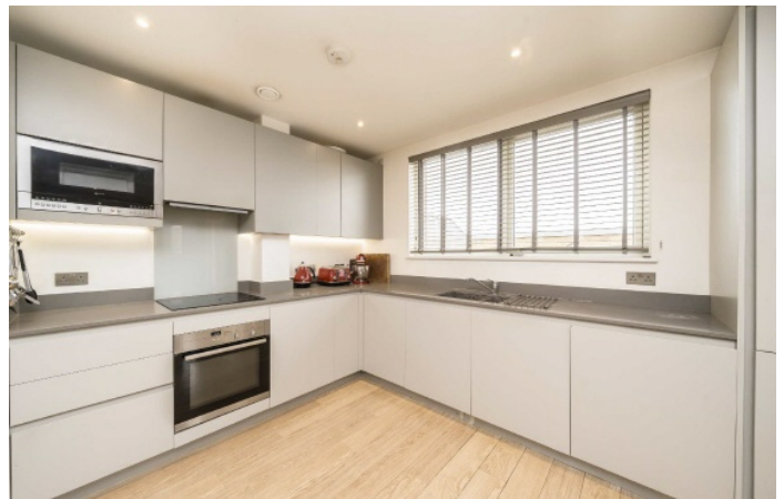
Stockwell Park Walk, SW9