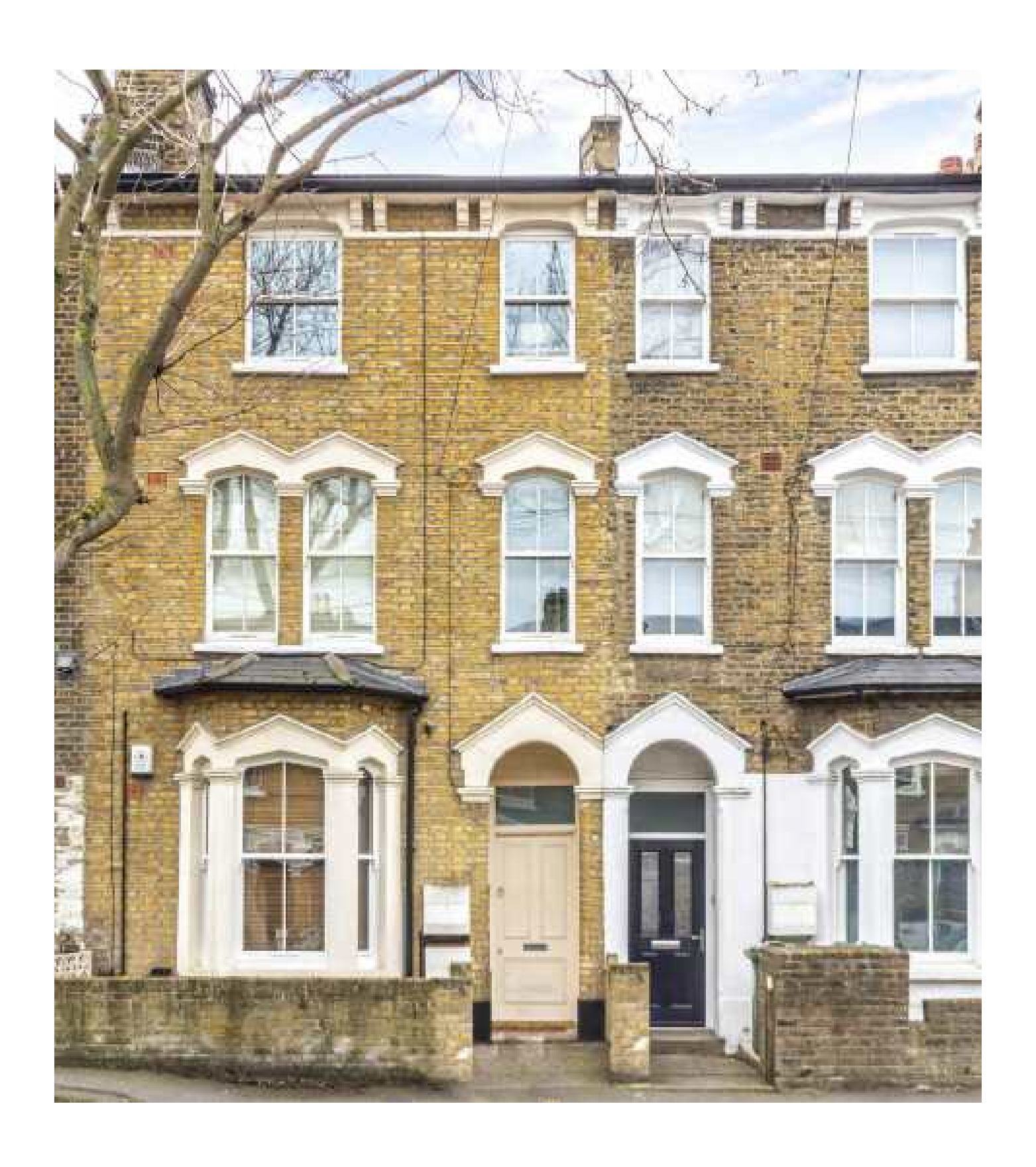
Dalyell Road, SW9 £5,600 Per week