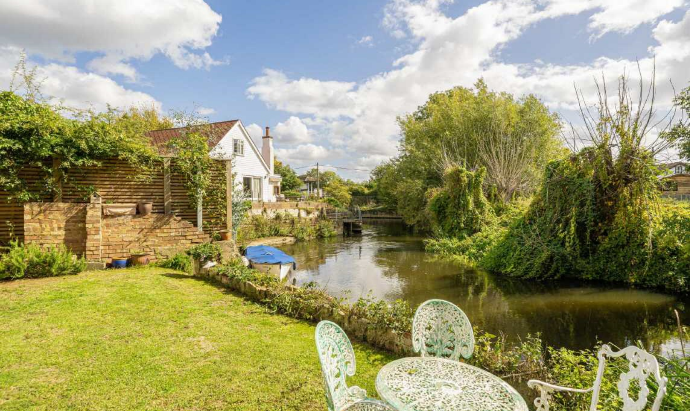
The Creek, TW16 £710,000