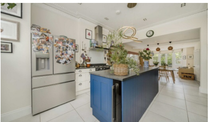
Rylett Crescent, W12