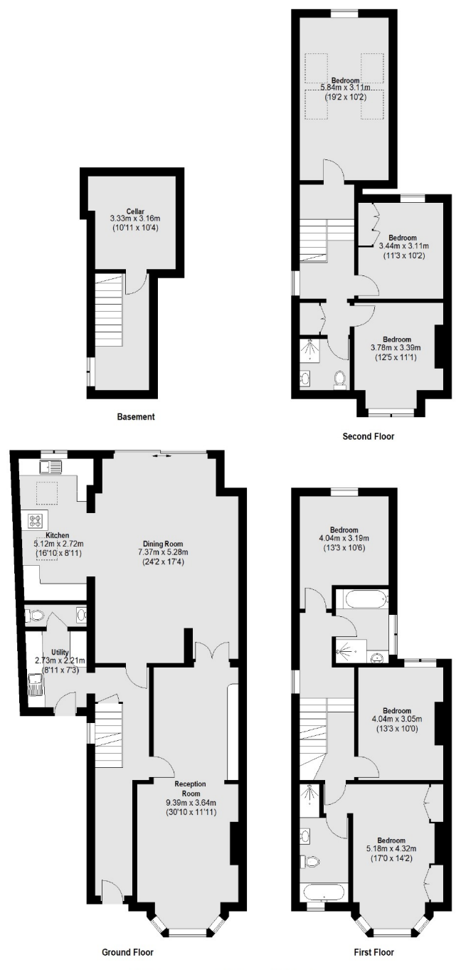
Total area (approx.): 246.67 sq. m (2655 Sq. ft)

Fletchers Chiswick Turnham Green Sales 58 Turnham Green Terrace London W4 1QP 020 8987 3000 chiswicksales@fletcherestates.com