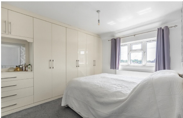
Cherry Crescent, TW8