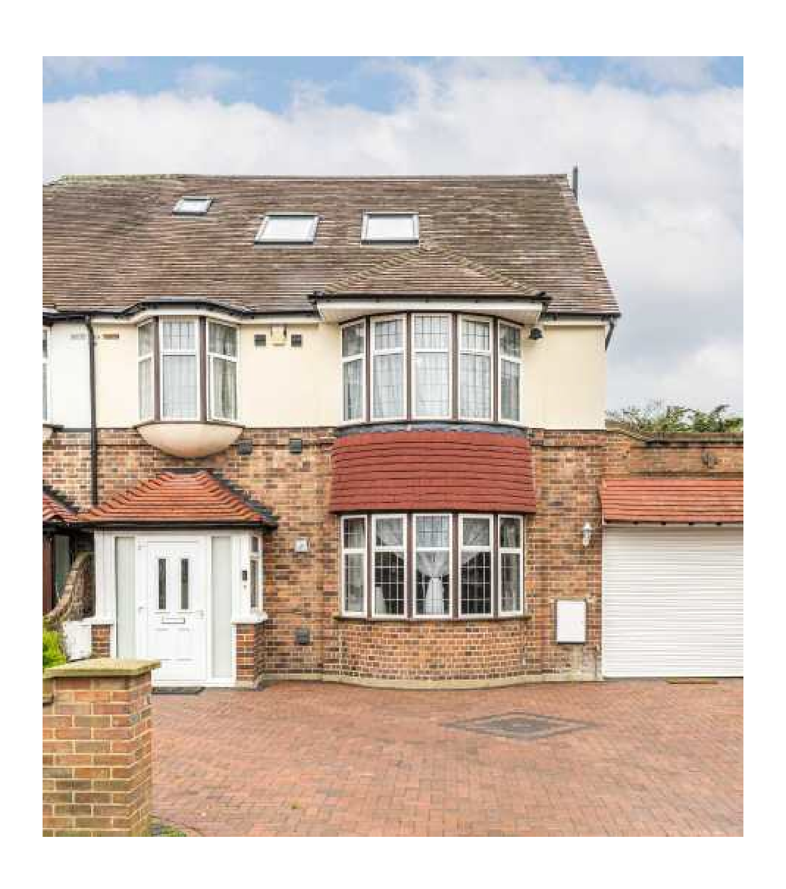
Bath Road, TW3 £1,400,000