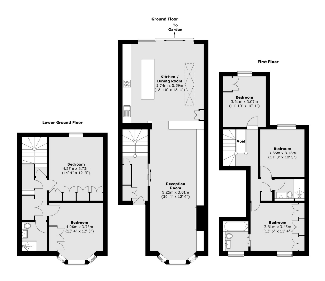
Total area (approx.) : 179.5 sq. m (1932 sq. ft)