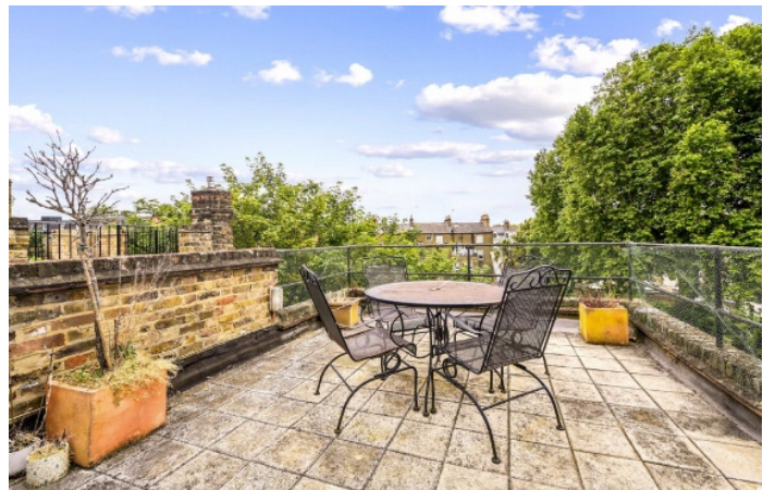
Earl's Court Square, SW5