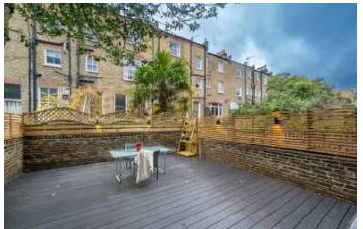
Comeragh Road, W14