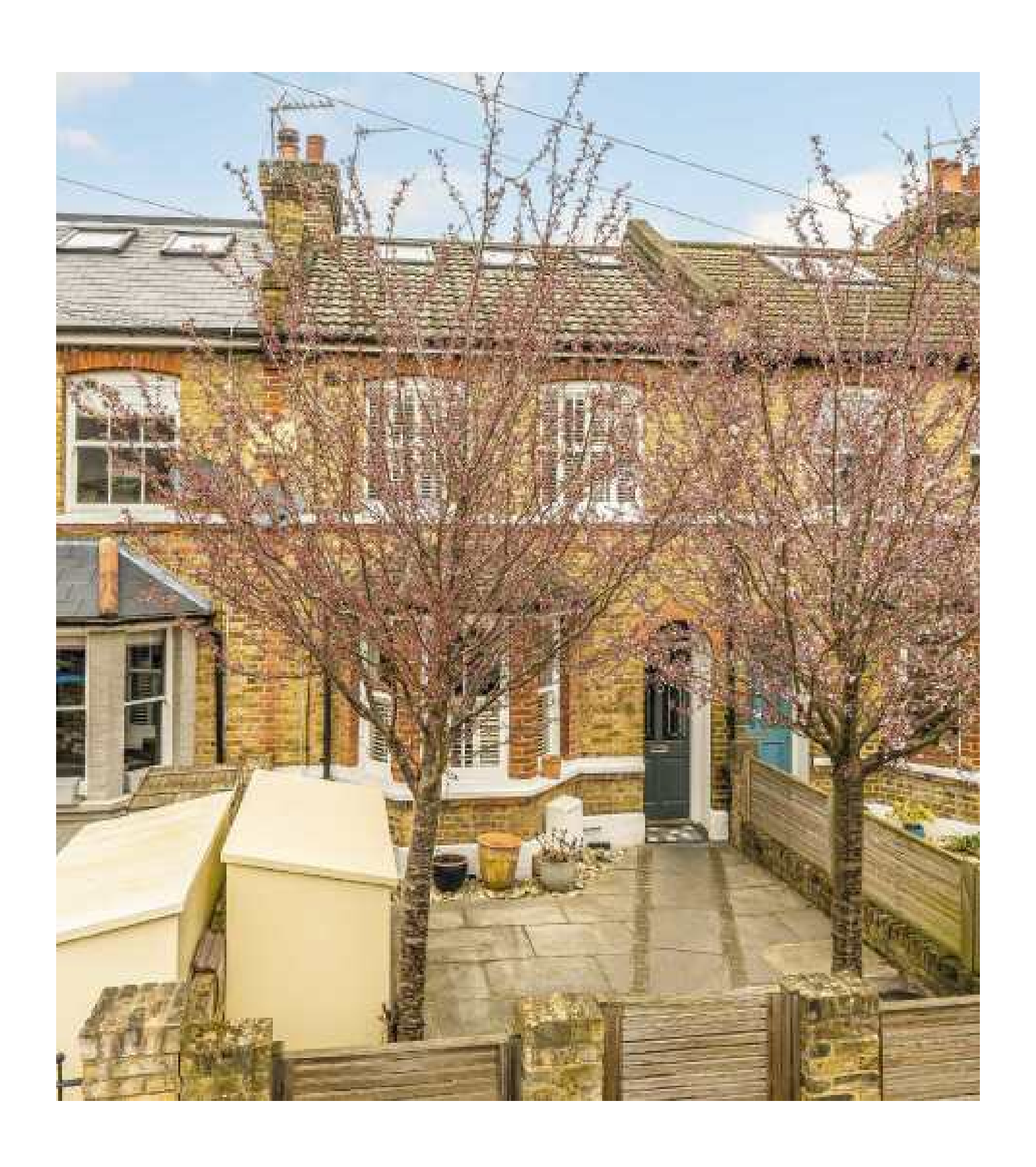
Fairfax Road, TW11 £1,139,950