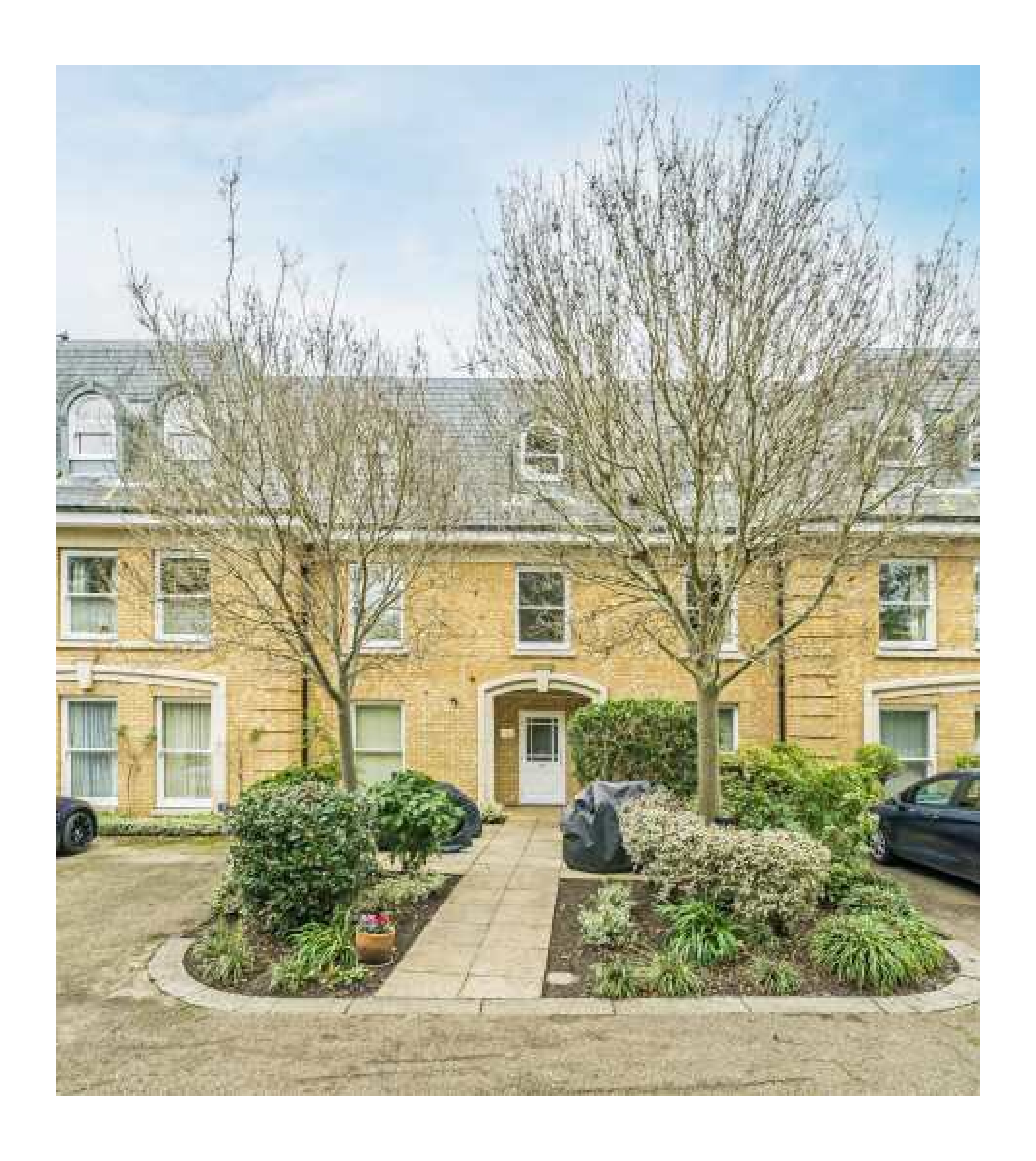
Holmesdale Road, TW11 £749,950