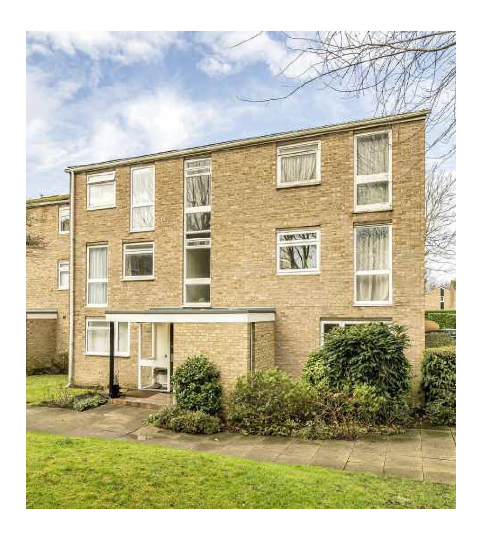
Harrowdene Gardens, TW11 £325,000