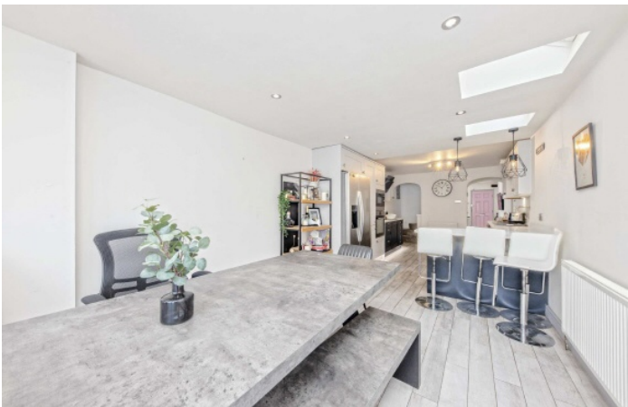
Alexandra Road, KT7