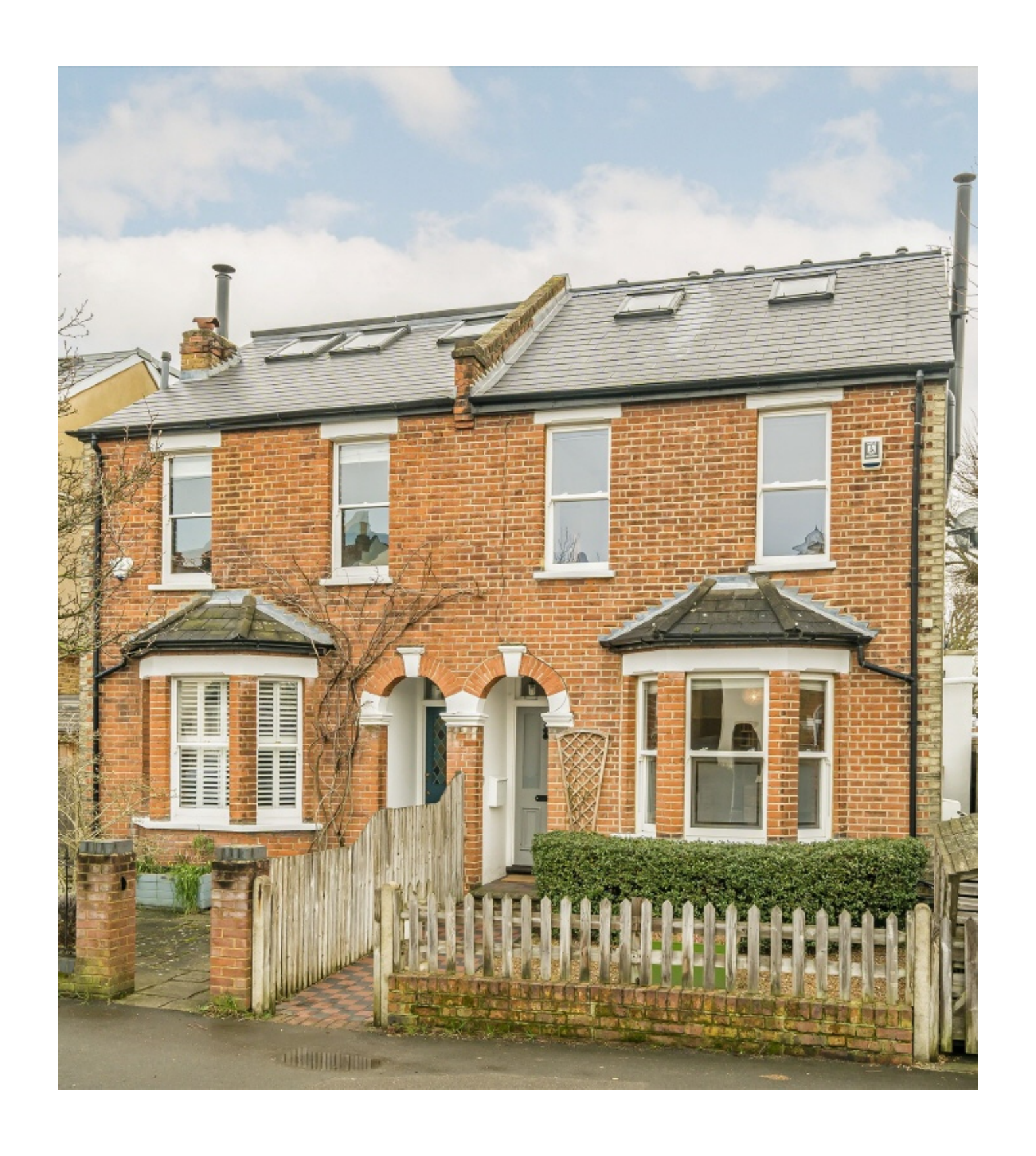
Ellerton Road, KT6 £1,095,000