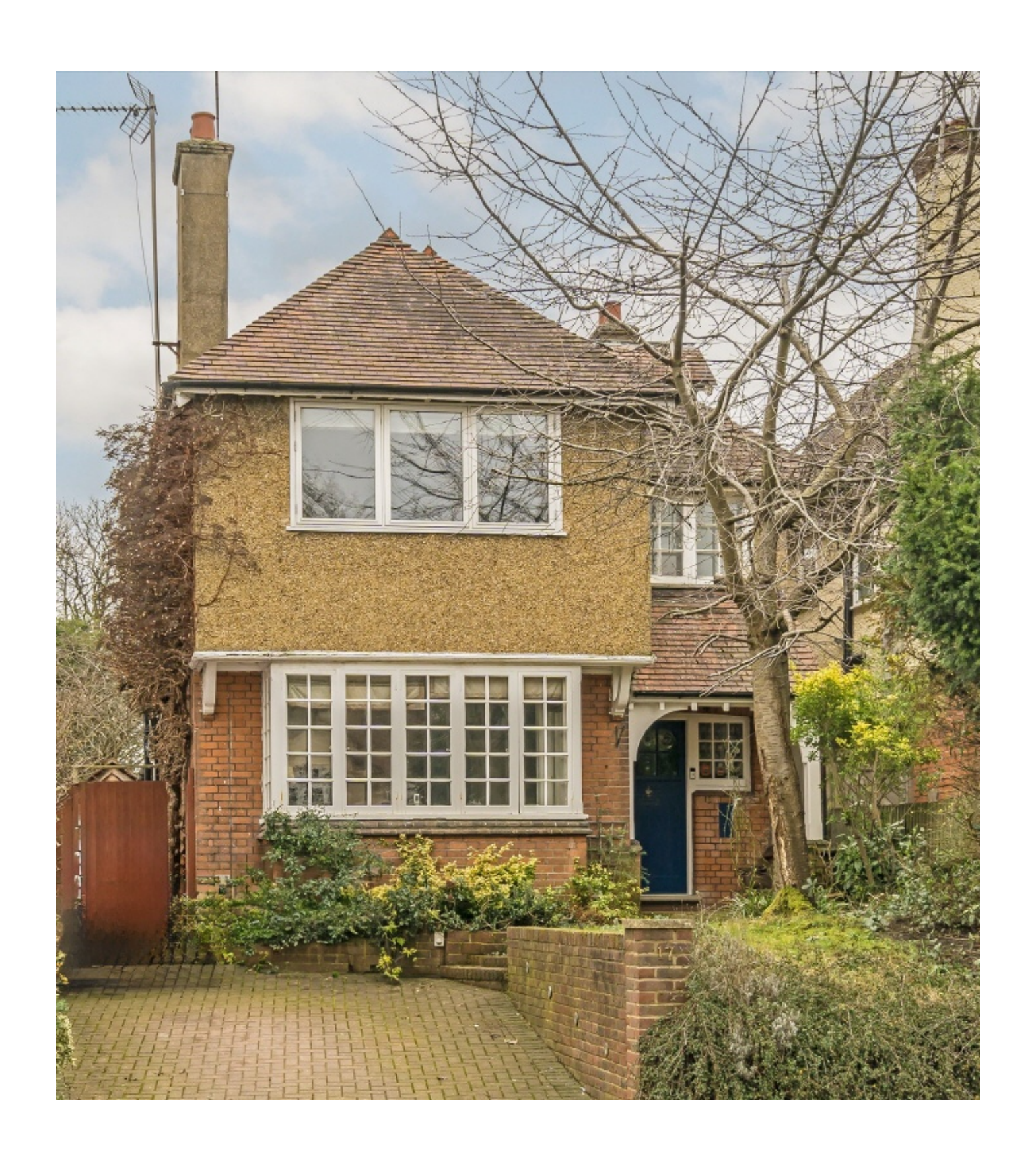
Portsmouth Road, KT7 £1,250,000