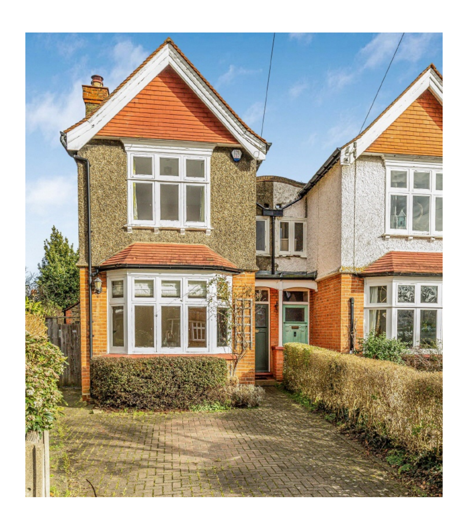
Bond Road, KT6 £775,000