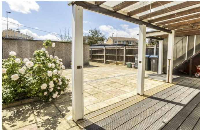
Hook Rise South, KT6