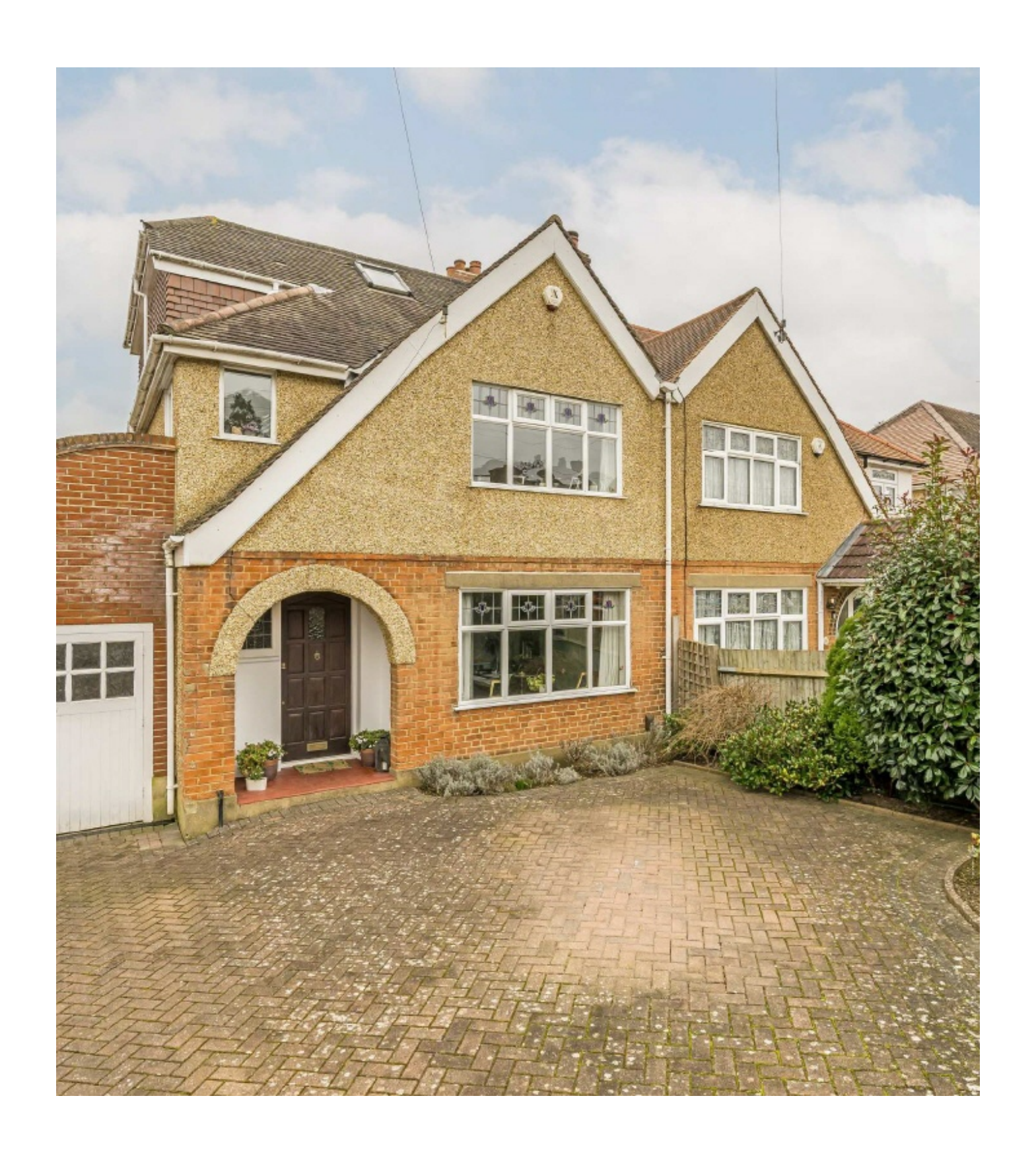
Chiltern Drive, KT5 £1,095,000