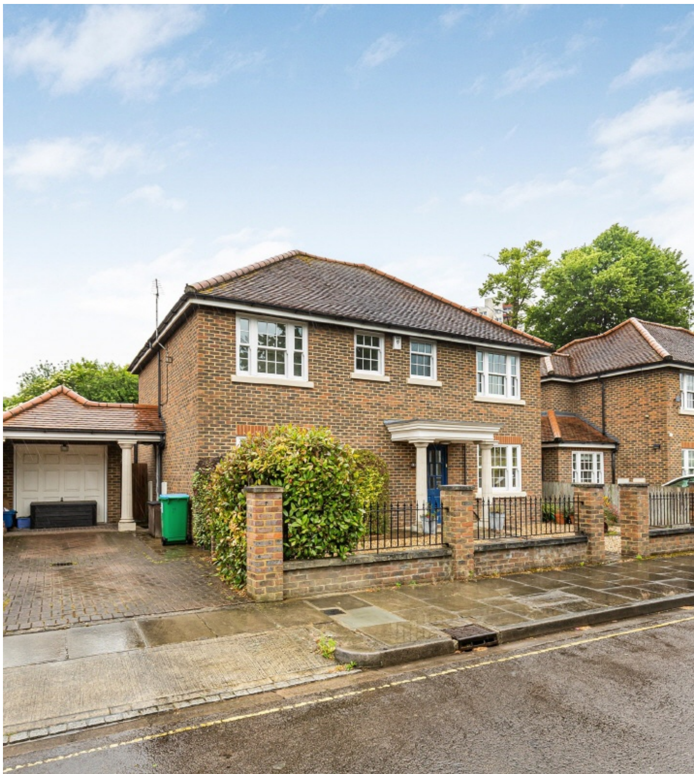
Burnside Close, TW1 £1,400,000