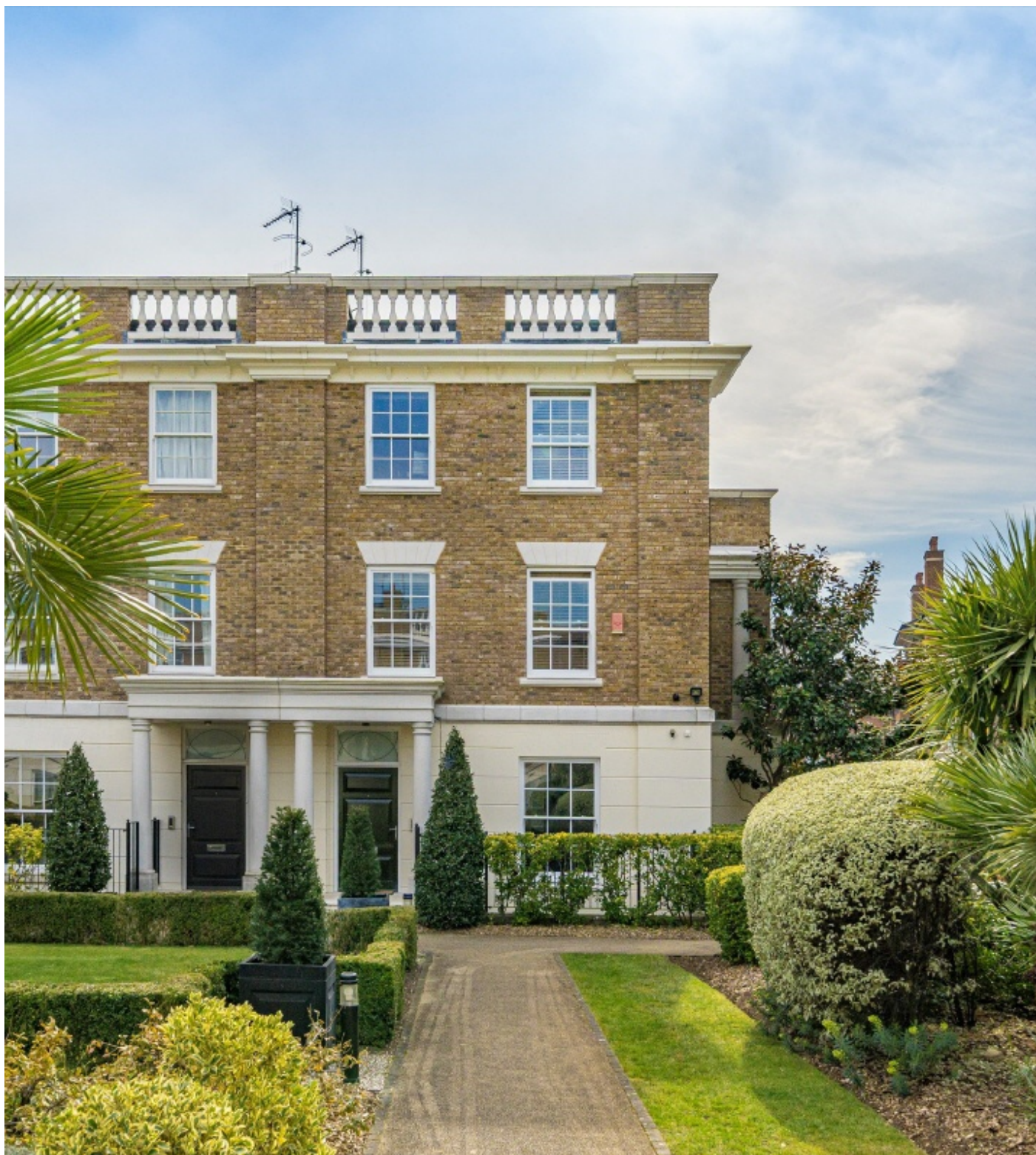
Corsellis Square, TW1 £2,500,000