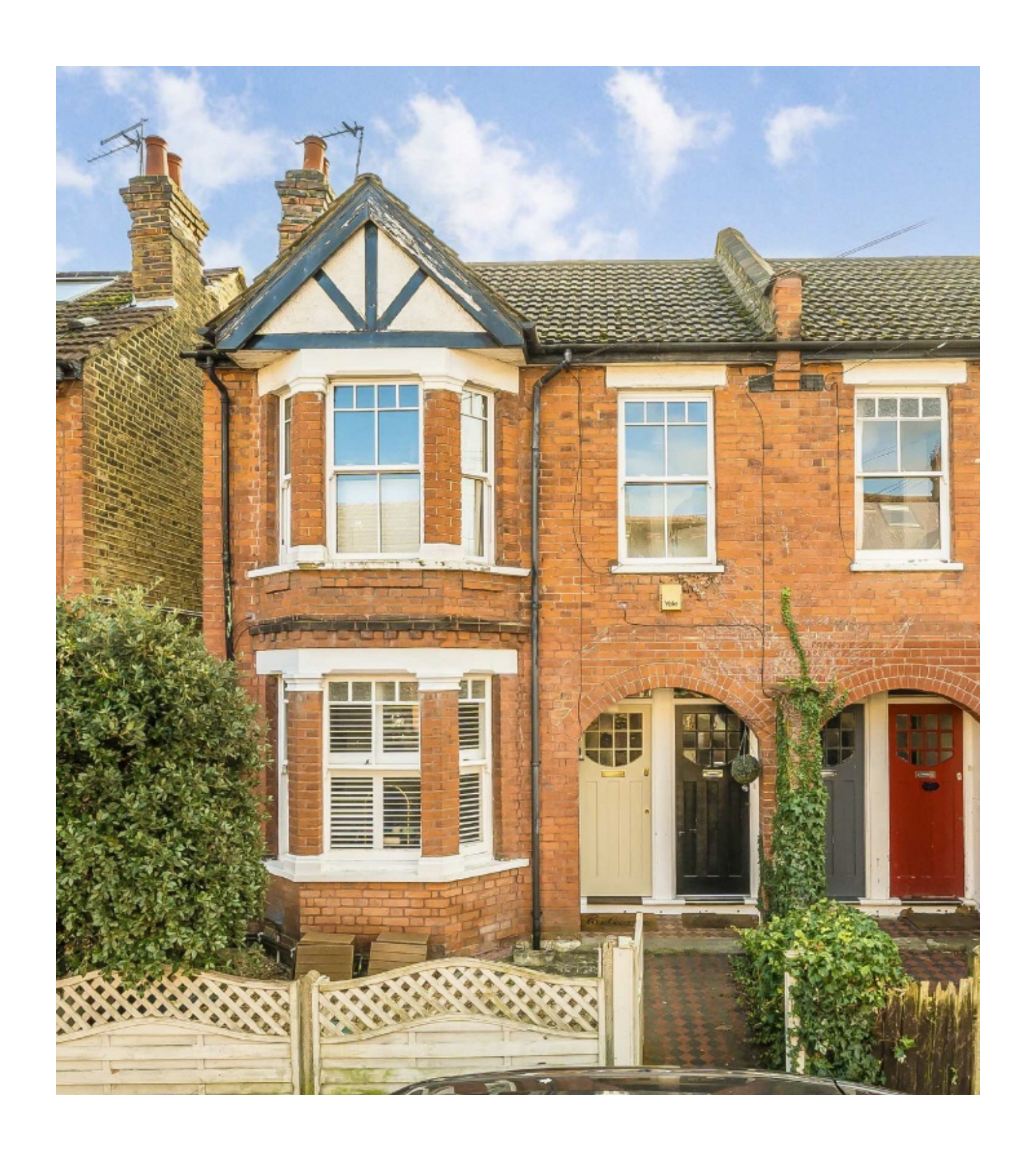
Godstone Road, TW1 £675,000