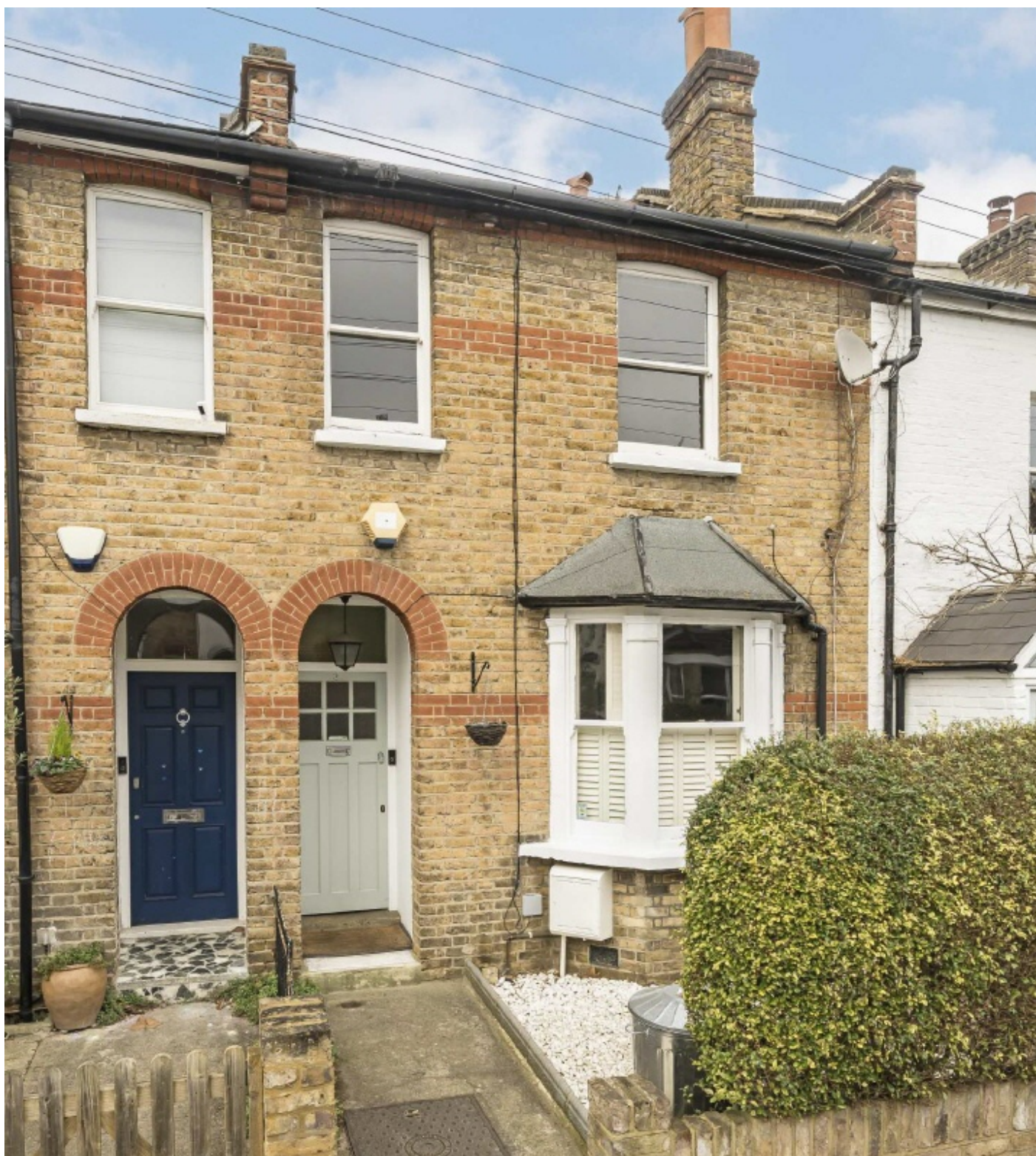
St. Margarets Grove, TW1 £1,325,000