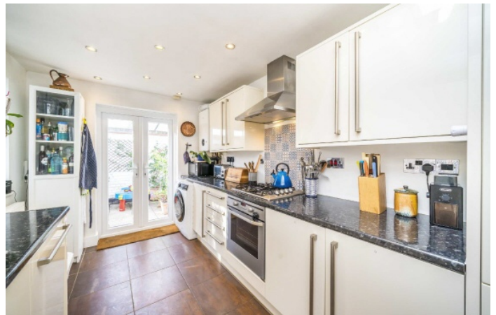
Queens Terrace, TW7