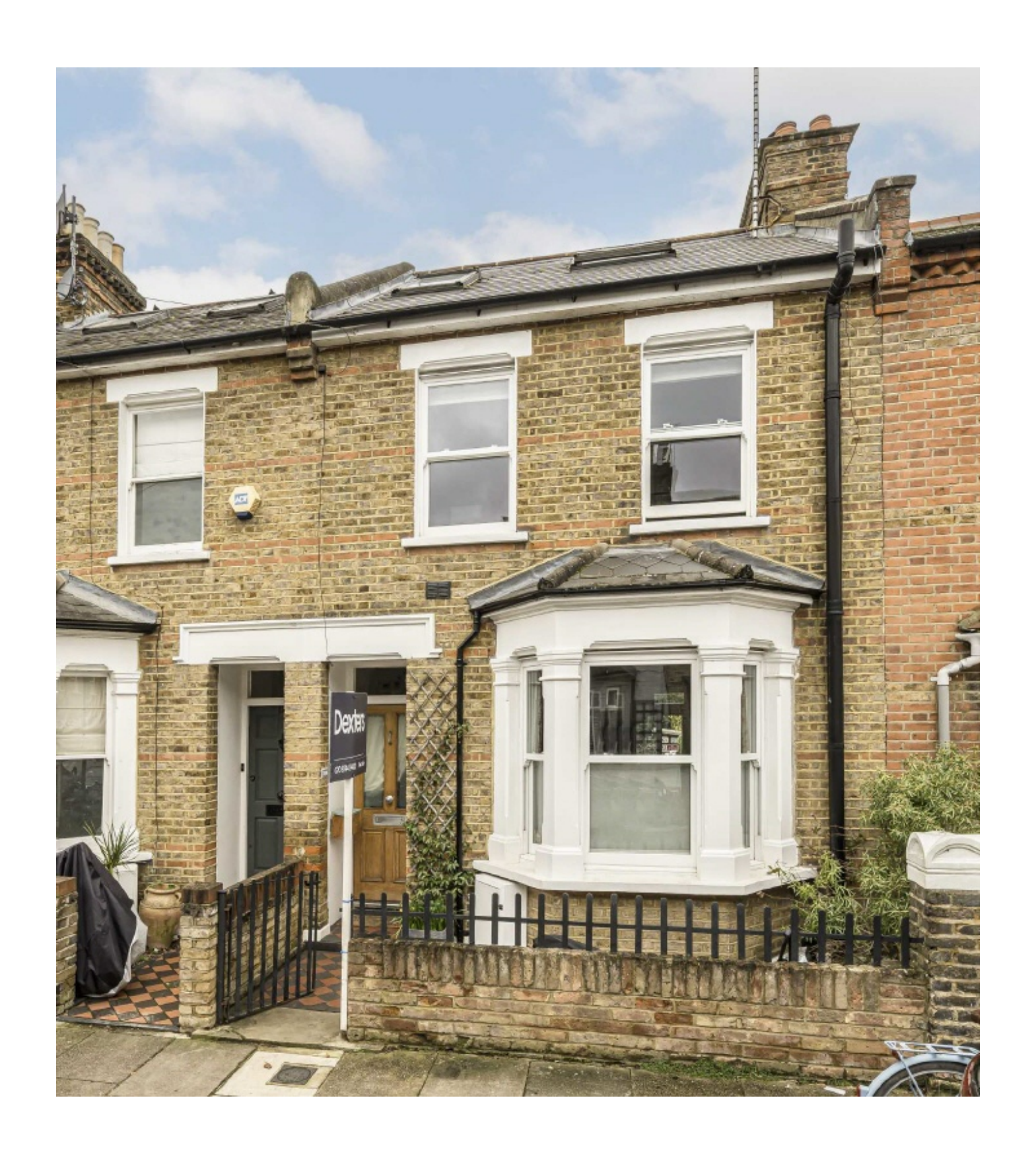
Haliburton Road, TW1 £949,950