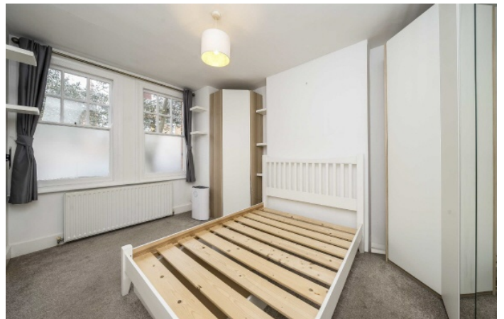
Dancer Road, TW9