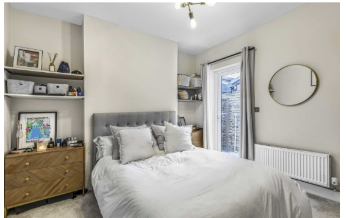
Niton Road, TW9