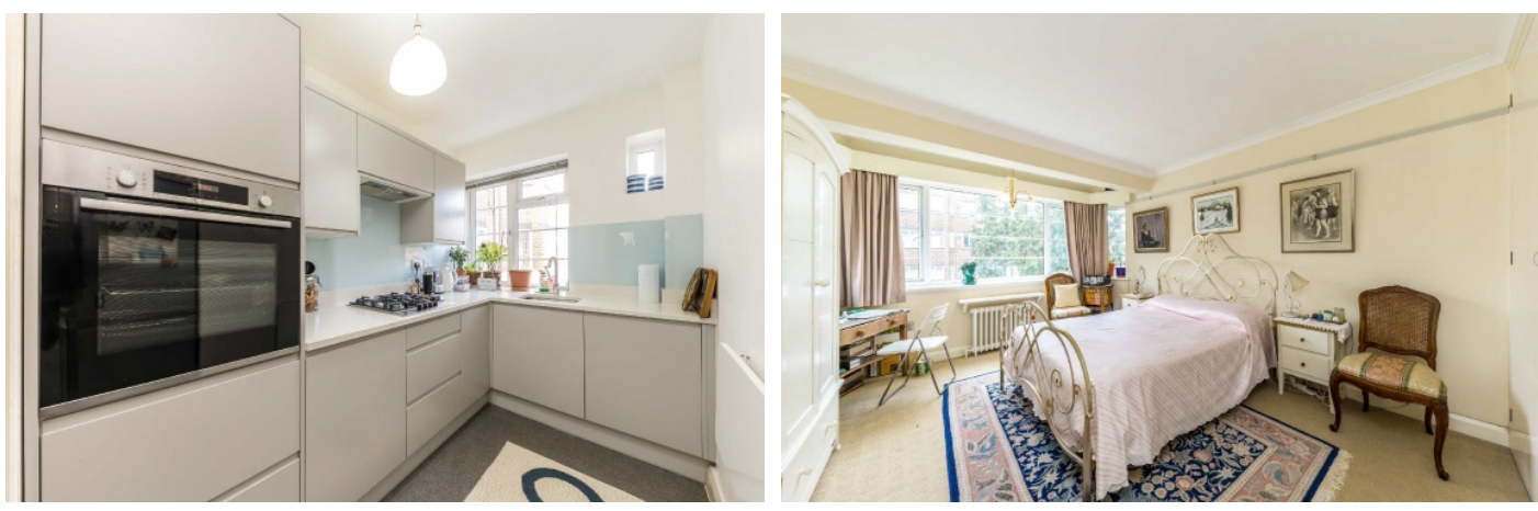
Sheen Court, TW10