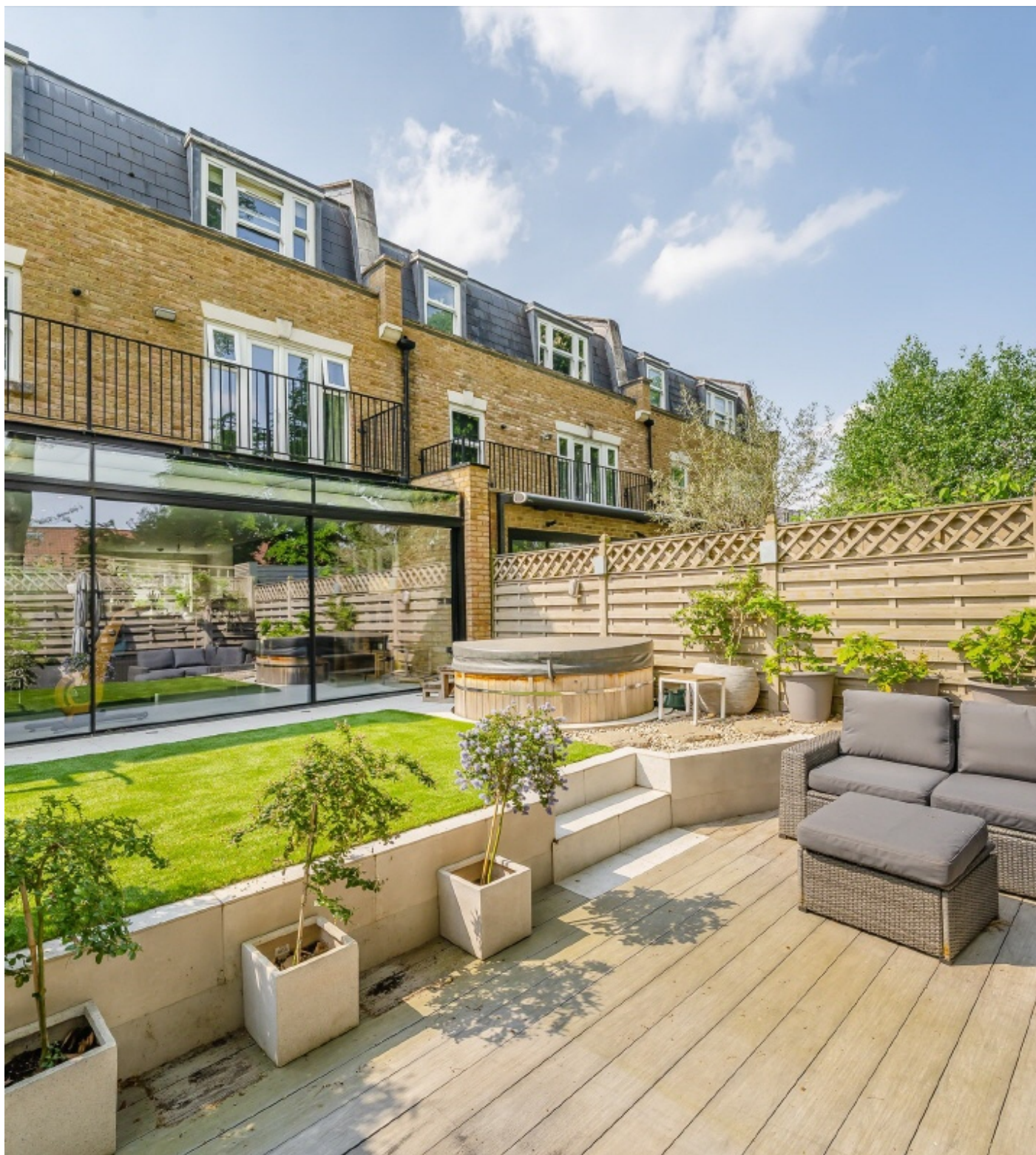
Emerald Square, SW15 £1,500,000