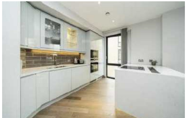
Drapers Yard, SW18