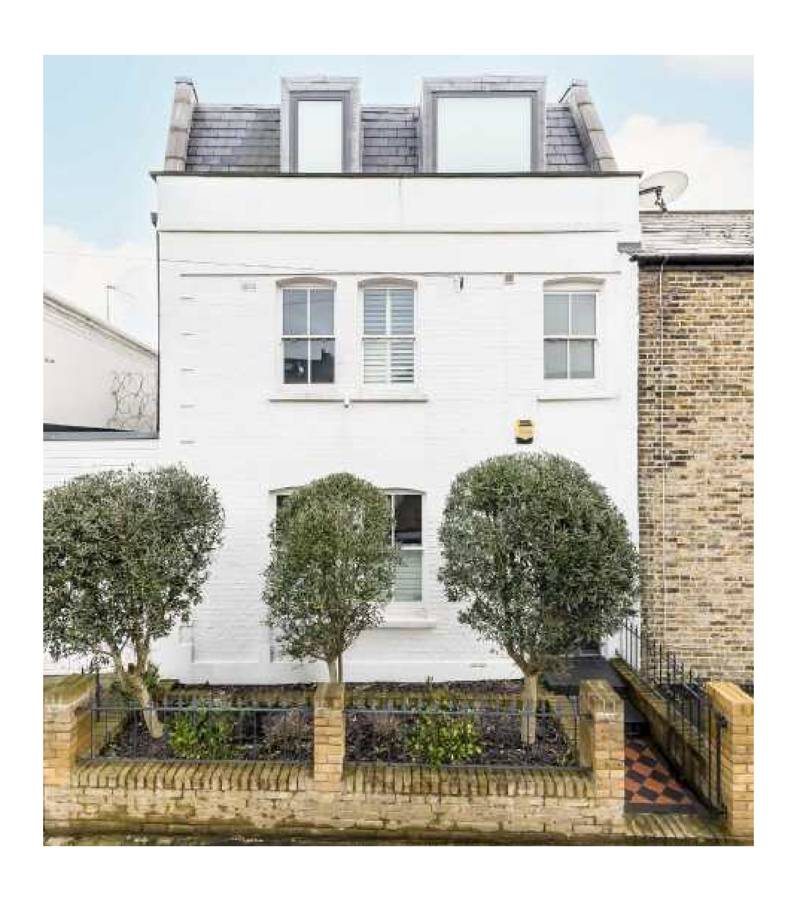
Wadham Road, SW15 £1,300,000