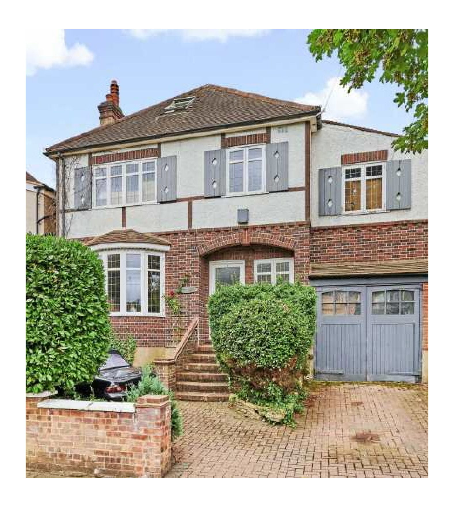
Skeena Hill, SW18 £1,900,000