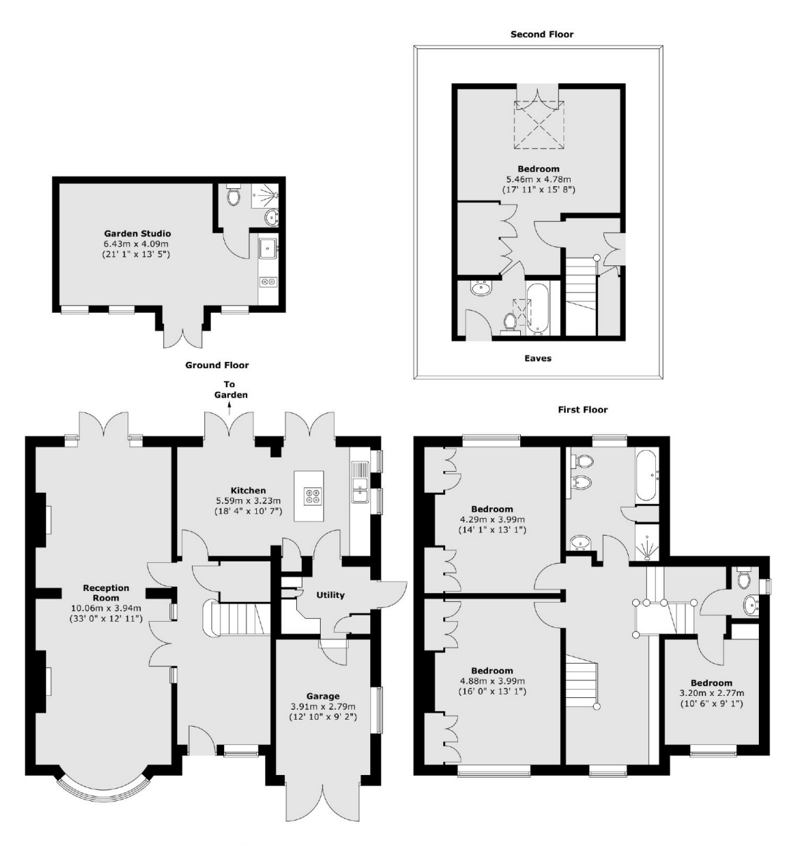
Total area (approx.) : 207.5 sq. m (2234 sq. ft) Total garden studio (approx.) : 23.7 sq. m (255 sq. ft) (Excluding eaves)