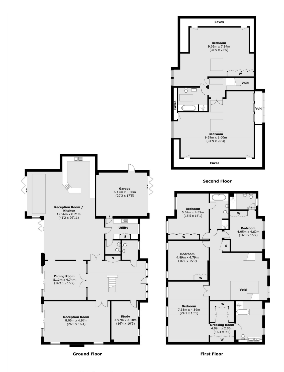
Total area (approx.): 595.6 sq. m (6,411.0 sq. ft) (Excluding Void / Eaves)