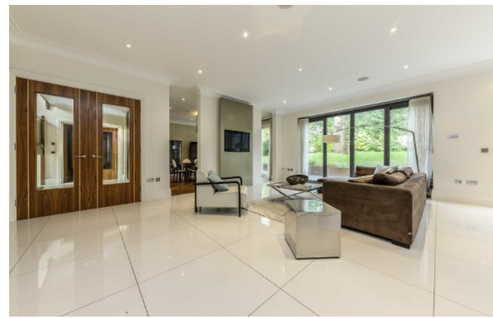
Neville Avenue, KT3