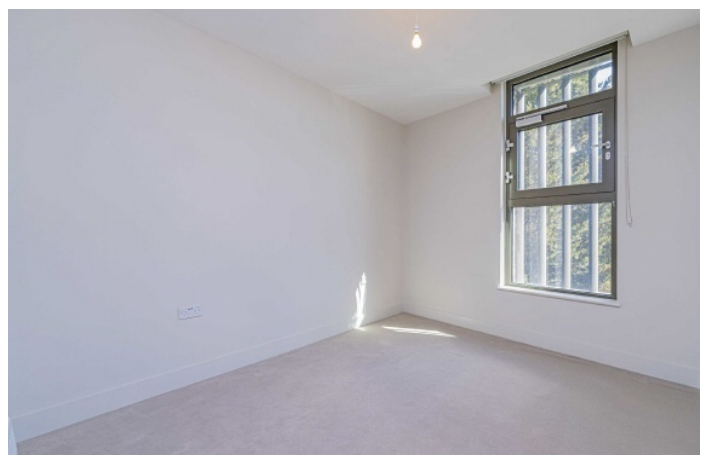
Coombe Road, KT2