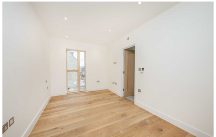
Hampden Road, KT1