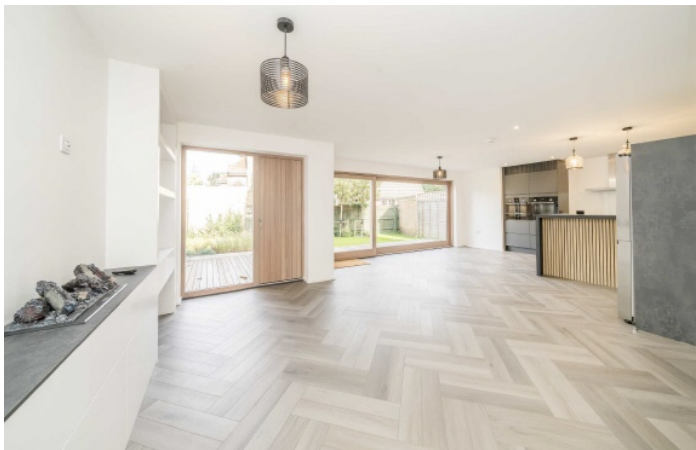
Broad Lane, TW12