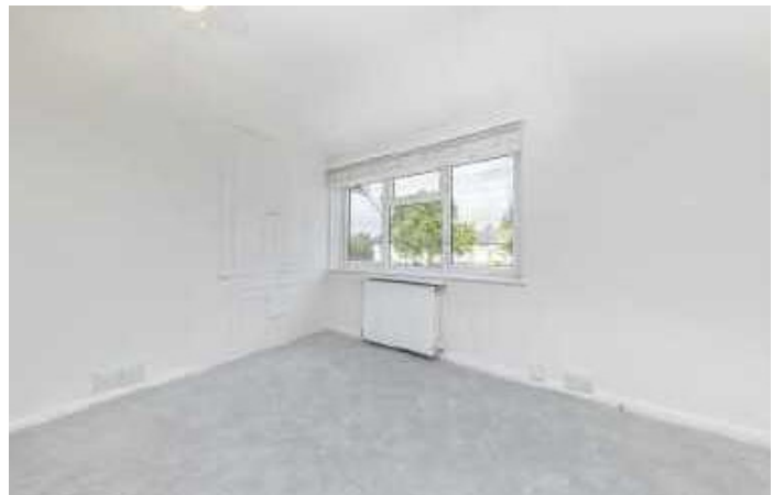
Bloxham Crescent, TW12