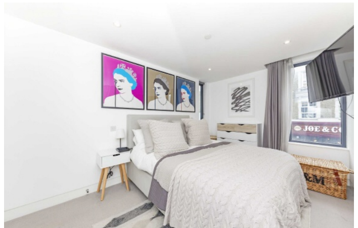
North End Road, SW6