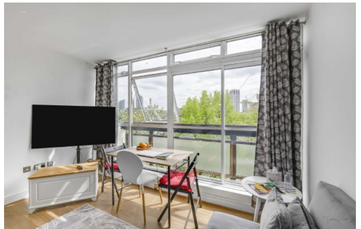
Fulham Road, SW6