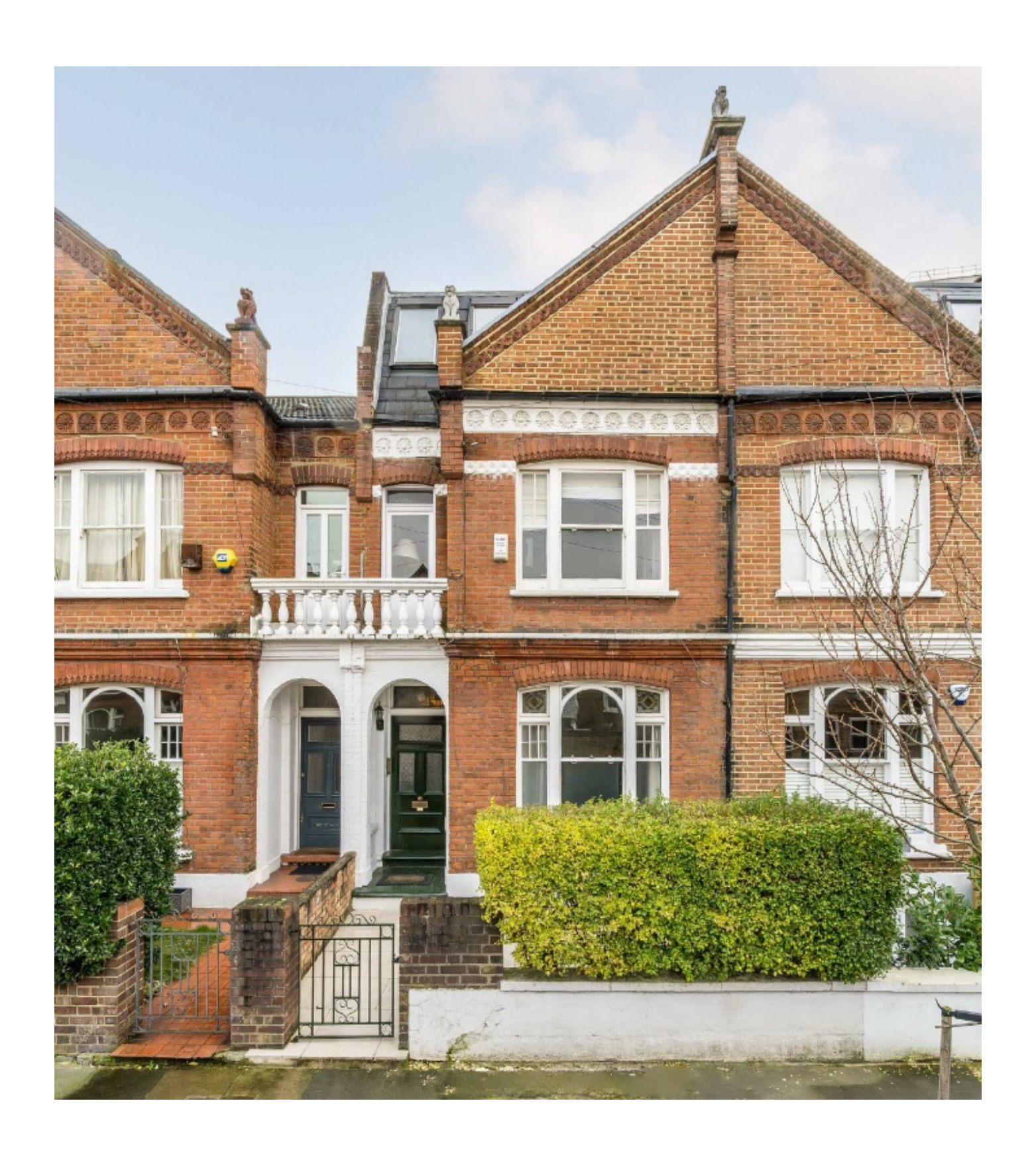
Bovingdon Road, SW6 £1,100,000