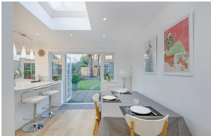
Perivale Lane, UB6