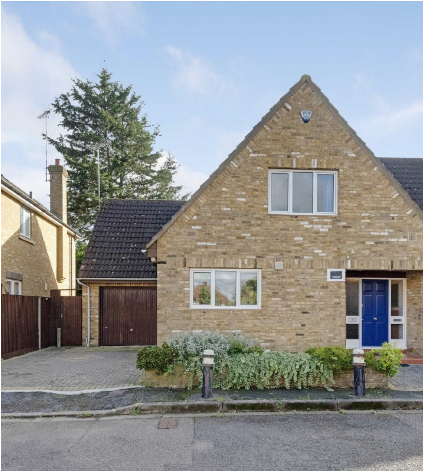
Robinsons Close, W13 £1,299,000